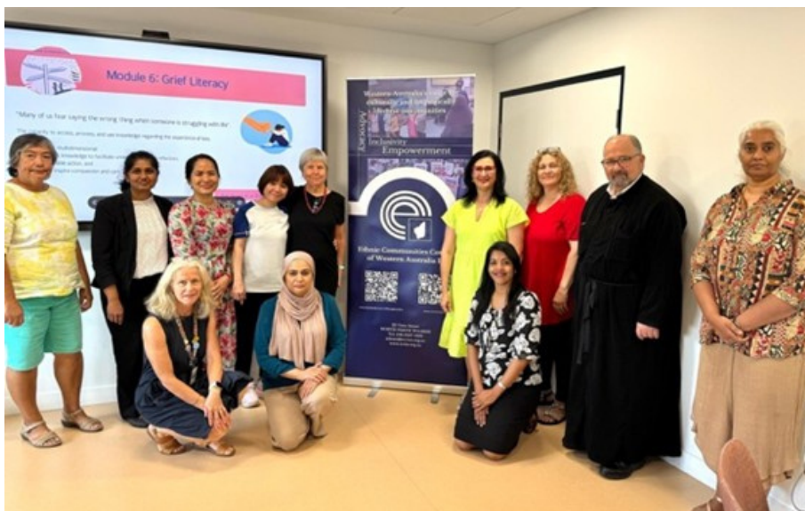
Training for community representatives from language groups – Tamil, Vietnamese, Karen/Burmese, Arabic and Greek.

This is a 3-year project where ECCWA is responsible for recruiting community representatives and providing training to connect them with their own communities in the most culturally appropriate ways and provide guidance. The trained (activated) connectors will then continue on with conversations in their communities in their languages.